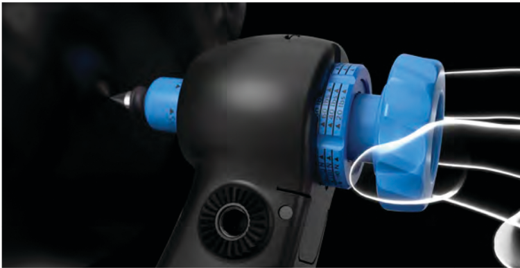
Integrated Pin Force Indication